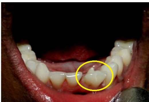
Figure 2: Talon’s cusp on the lingual side of the 2 fused teeth (encircled)