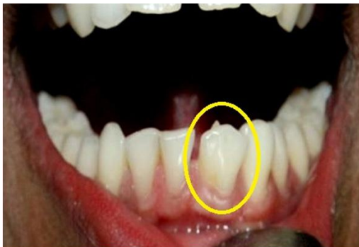
Figure 1: Fusion of mandibular left central and lateral incisors (encircled).

An intra-oral periapical radiograph for both the teeth was taken which revealed a radio-opaque area between the crown portion of both the teeth. Further, radiograph revealed no interdental space in between the teeth suggestive of fusion ( Figure 3 ).