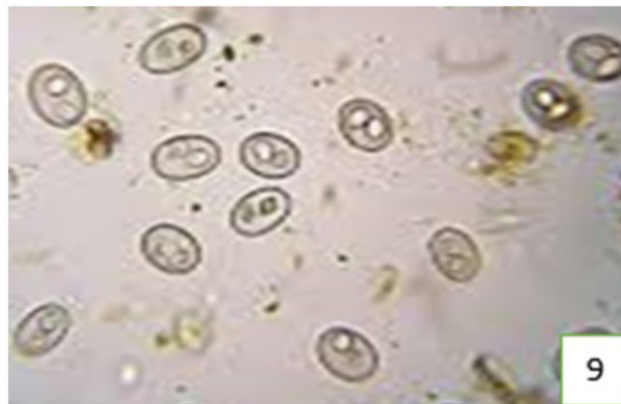
Figure 9: show of fasciola eggs after Sphincterotomy