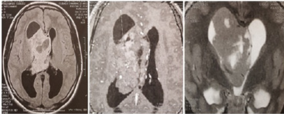
Figure 1: axial T1 and T2 weighted MRI without and with injection of gadolinium showing a process of heterogeneous signal located in the body of the left lateral ventricle which is widened. We Note after the gadolinium injection a moderate enhancement of the tumor

operative progress, without tumor recurrence, and the patients did not benefit from chemotherapy or radiotherapy (Figure 2). Stereotactic radiosurgery (SRS) has been demonstrated to be effective in the primary treatment of CN in cases where surgical resection might be difficult, like relatively small tumors (<10 cm 3 ) or asymptomatic tumors [25, 28-30]. Although the incidence is low, a large lesion treated with a relatively high dose in SRS may tend to develop complications [28, 30].